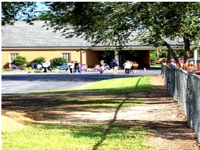
Families of Faith