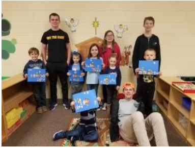
Youth Christmas Party

Youth and Glow Kids collaborate with Christmas Stickers.